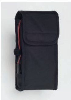
Complete with toolbelt holster and croc clip adaptor